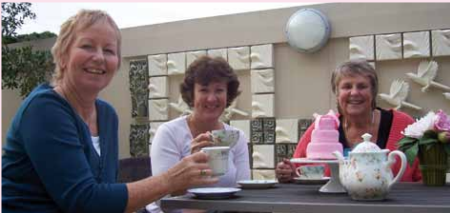
Family Support Team

This is important for catering purposes.