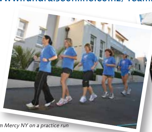
Team Mercy NY on a practice run